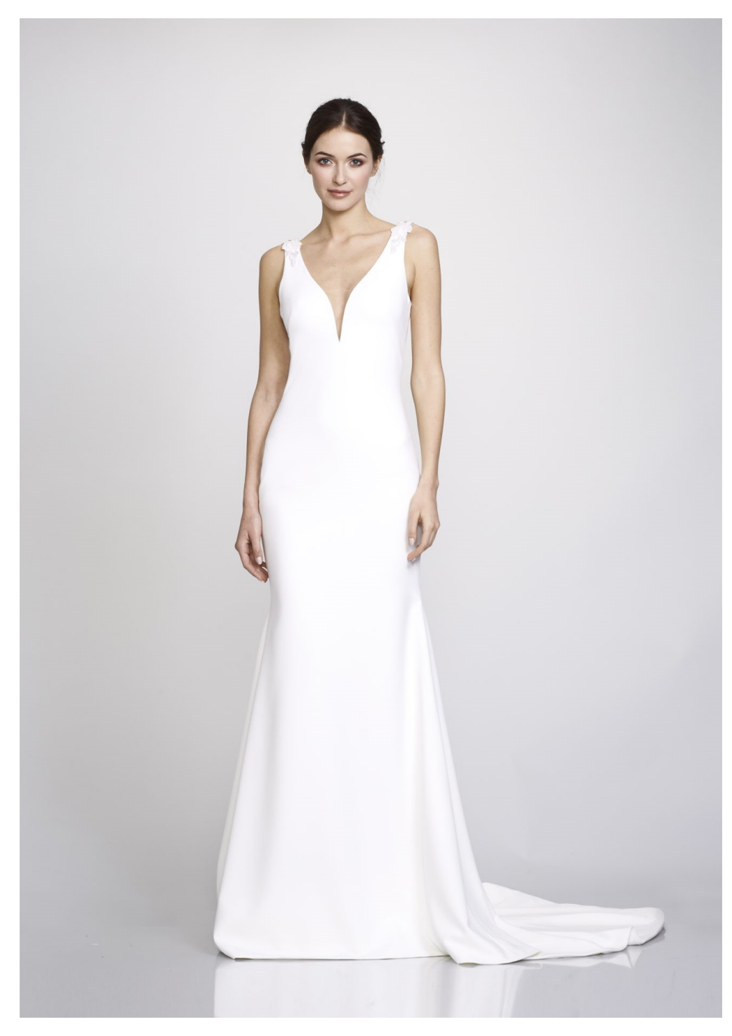
THEIA MEGHAN IVORY / BEADED SHOULDERS AND BACK UK12 WAS £1450 NOW £500