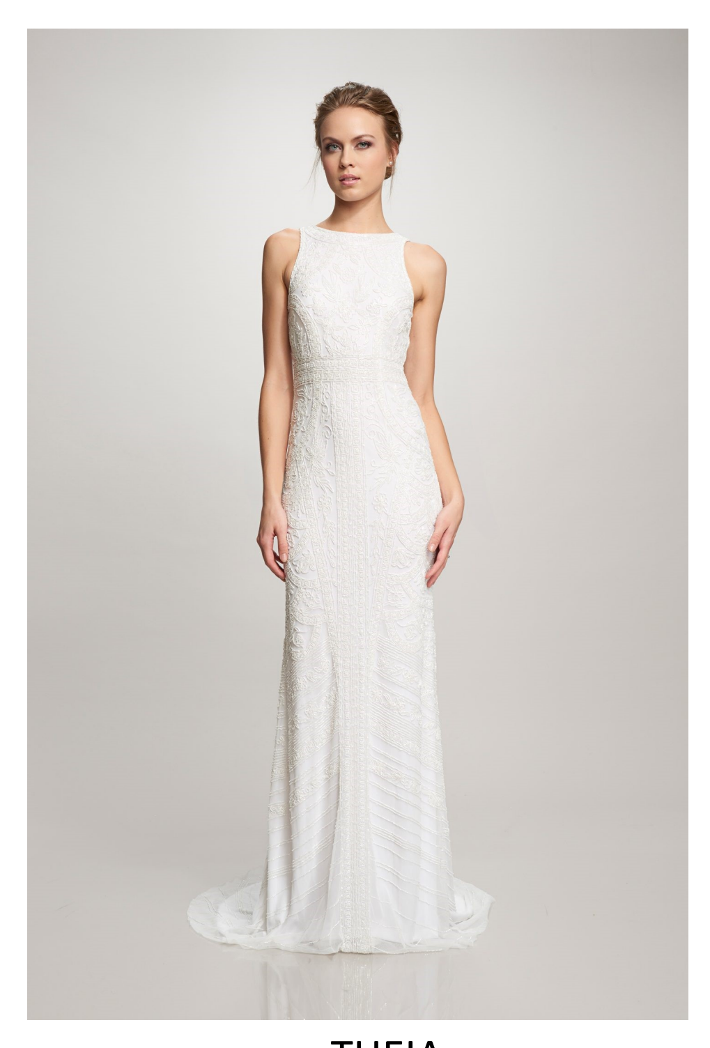
THEIA CHARLOTTE IVORY / BEADED UK10 WAS £1950 NOW £500