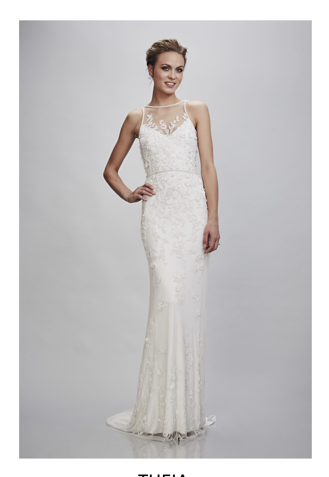
THEIA RACHELLE IVORY / BEADED UK10 WAS £1950 NOW £500