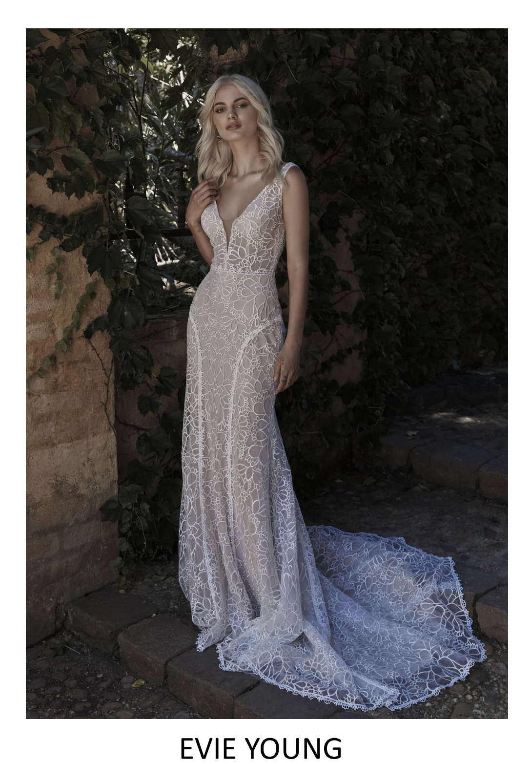
JOSS IVORY/MOCHA UK10 WAS £1,700 NOW £900