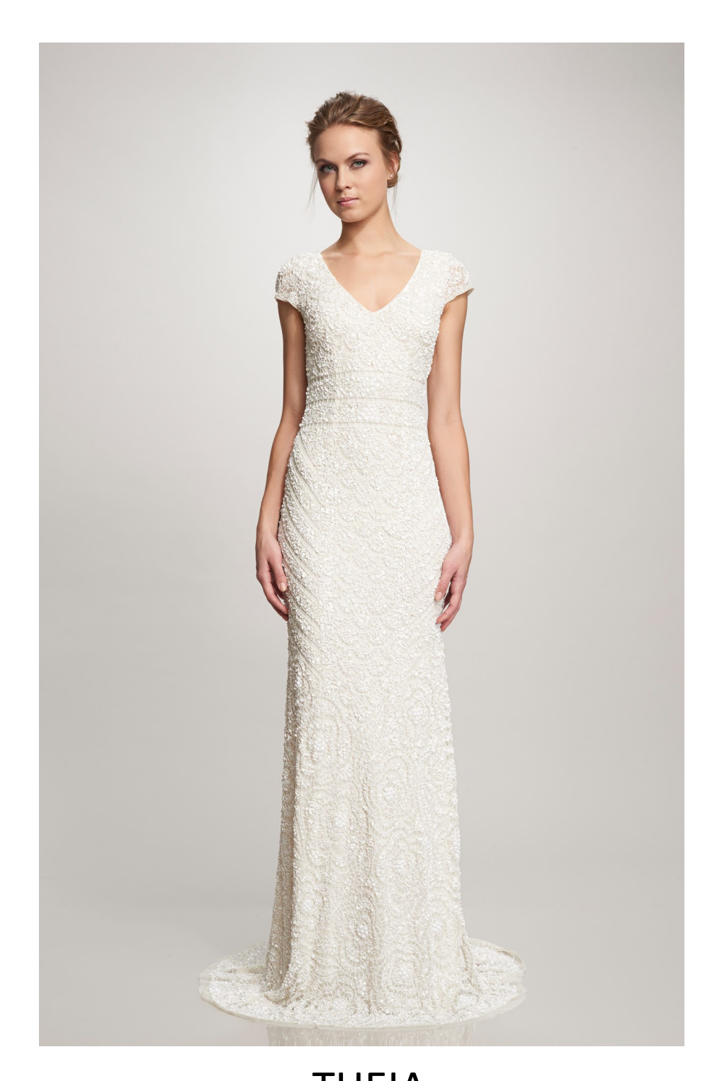
THEIA LILIA IVORY / BEADED UK12 WAS £1850 NOW £500